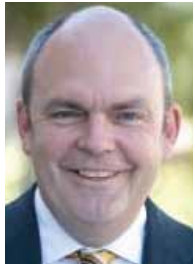
Transport Minister Steven Joyce spoke at the Conference